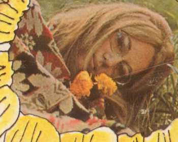
"Kissing her here in the grass"